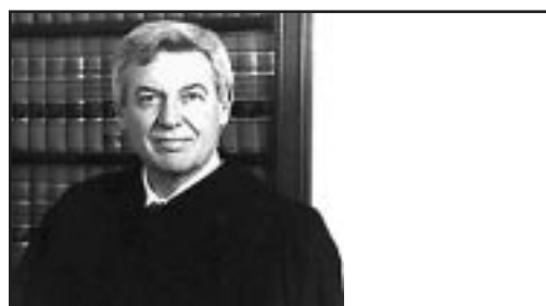
Justice Charles Wells