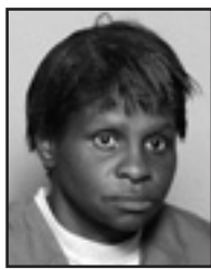
CYNTHIA NIXON Offering for Prostitution