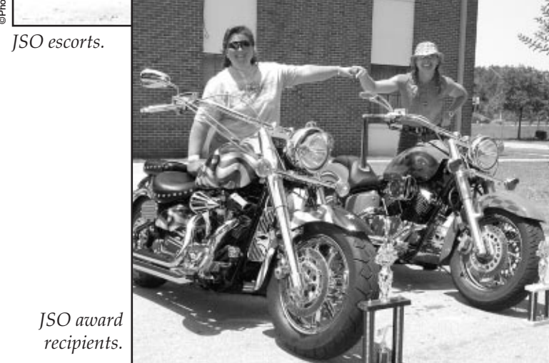
JSO award recipients.