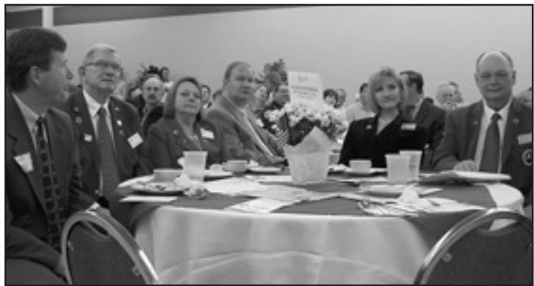
Title sponsors Allied Veterans of the World, Inc.