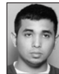
CHRISTIAN JAQUE Offering for Lewdness