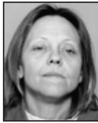
DAR NEPTUNE Offering for Prostitution