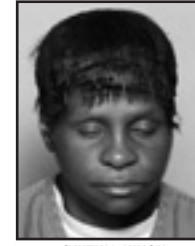
CYNTHIA NIXON Offering for Prostitution